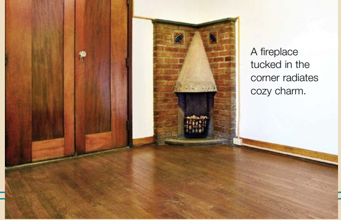
A fireplace tucked in the corner radiates cozy charm.