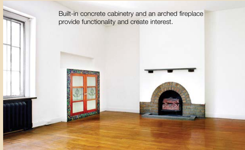
Built-in concrete cabinetry and an arched fireplace provide functionality and create interest.

Below: Beech wood floors complement earth-toned glass, while a partition lends an open feel to an apartment’s floor plan. At bottom: Large art-glass windows provide natural light